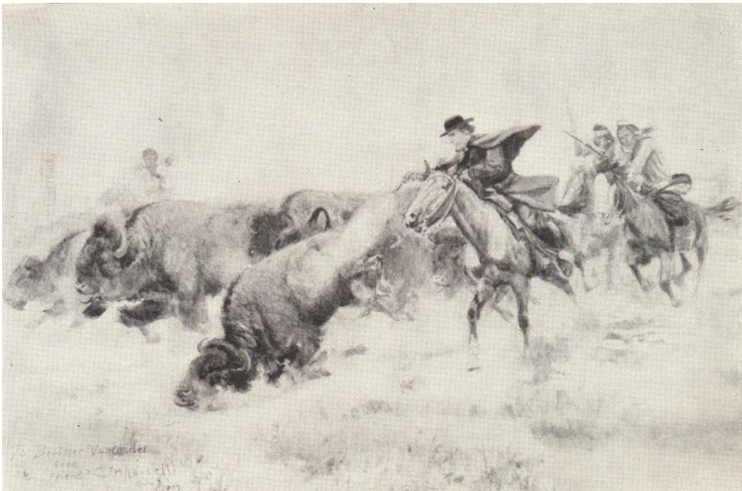
Charles M. Russell's painting "Brother Van Shooting Buffalo"