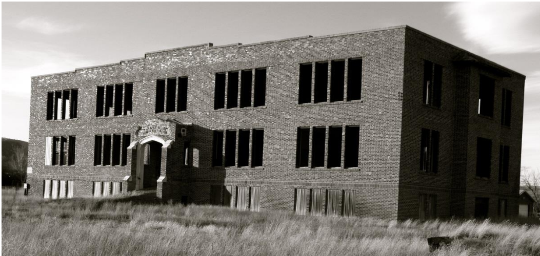
Van Orsdel Hall (2010) of Montana Wesleyan College 2

In 1923, Montana College in Deer Lodge, an institution of the Presbyterian Church with roots going back to 1878, merged into Montana Wesleyan to form Intermountain Union College. That institution occupied the Helena campus until 1935, when an earthquake destroyed some of the buildings. The school temporarily relocated in Great Falls for one year, and then moved to Billings in 1936 to share a campus with Billings Polytechnic Institute, which had been founded in 1908. In 1947 those two institutions formally merged to form Rocky Mountain College – which exists today as a school affiliated with the United Methodist Church.