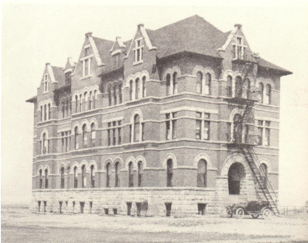
original Prickly Pear Valley building, 5 miles outside Helena used by Montana Wesleyan College and Montana Deaconess School

That building is now within the growing city of Helena, at the corner of North Montanan Avenue and Sierra Drive. Today the former Bozeman Deaconess School is Intermountain, a nationally accredited non-profit organization providing mental health and educational services, including residential treatment, to children and families in need. As noted on their web page, "Operating for more than 100 years, Intermountain is one of Montana's oldest child welfare agencies."