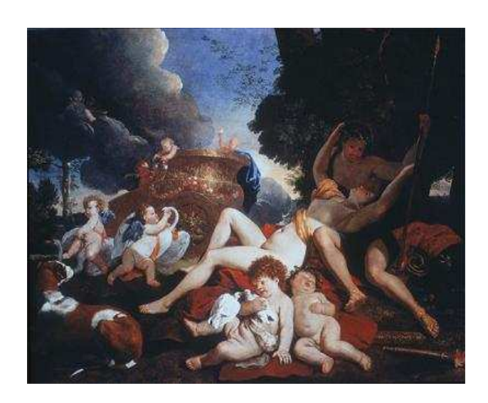
Poussin, Venus and Adonis, 1624-5, oil on canvas, Kimbell Art Museum