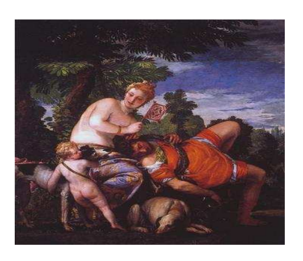
Veronese, Venus and Adonis , c. 1680, oil StaatlicheKunstsammlungen, Augsburg