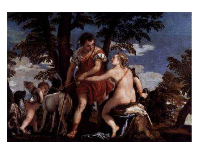
Veronese, Venus and Adonis c. 1562, Oil on canvas, on canvas, Museo del Prado