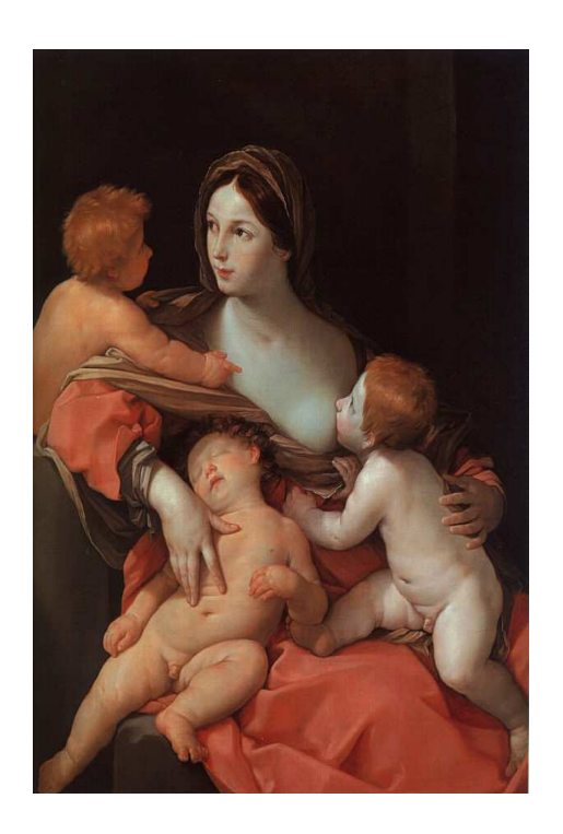
Guido Reni, Charity, before 1630, Metropolitan Museum of Art