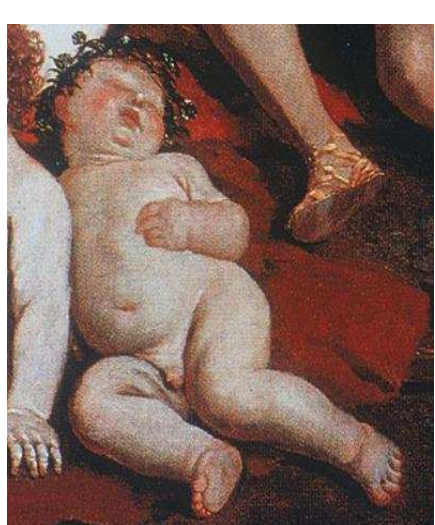
Venus and Adonis