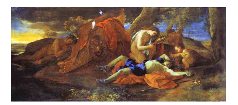
Poussin, Venus Lamenting Over Adonis , c. 1630 Oil on canvas, Musee des Beaux Arts, Caen, France