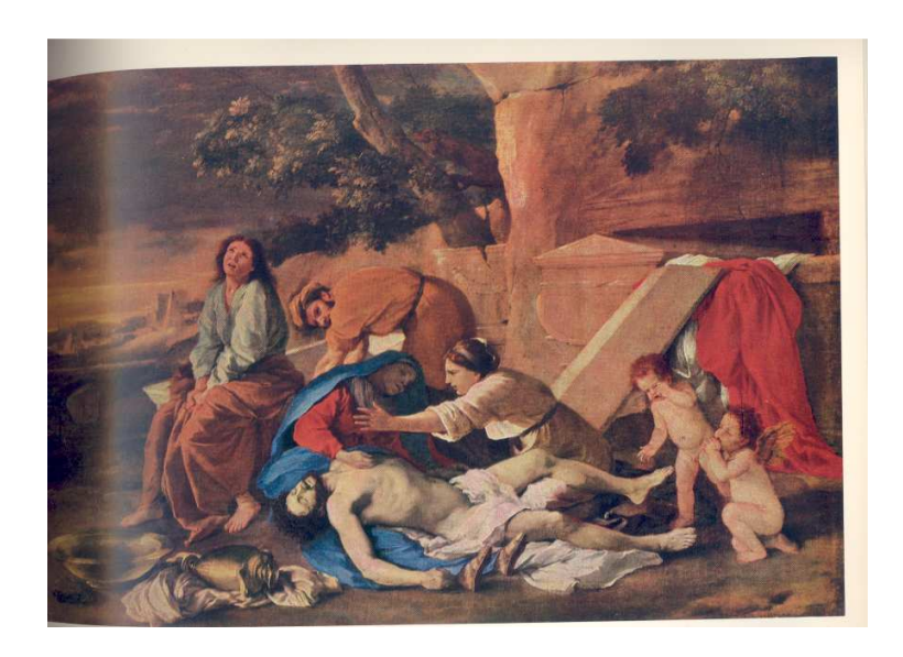
Munich Pinakothek Lamentation, c. 1628