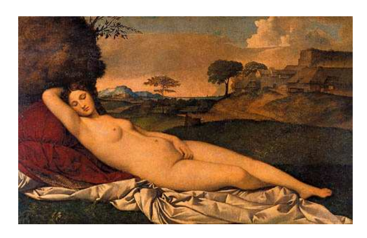
Giorgione, Sleeping Venus, ca. 1510, oil on canvas, Gemäldegalerie