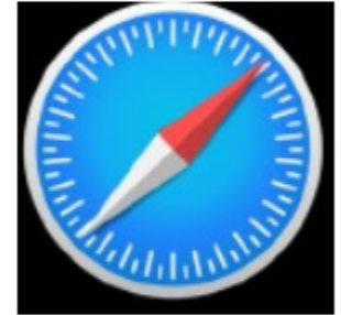
Apple Safari (Version 9+)