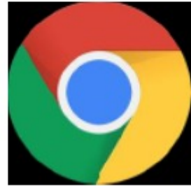
Google Chrome (Version 76+)