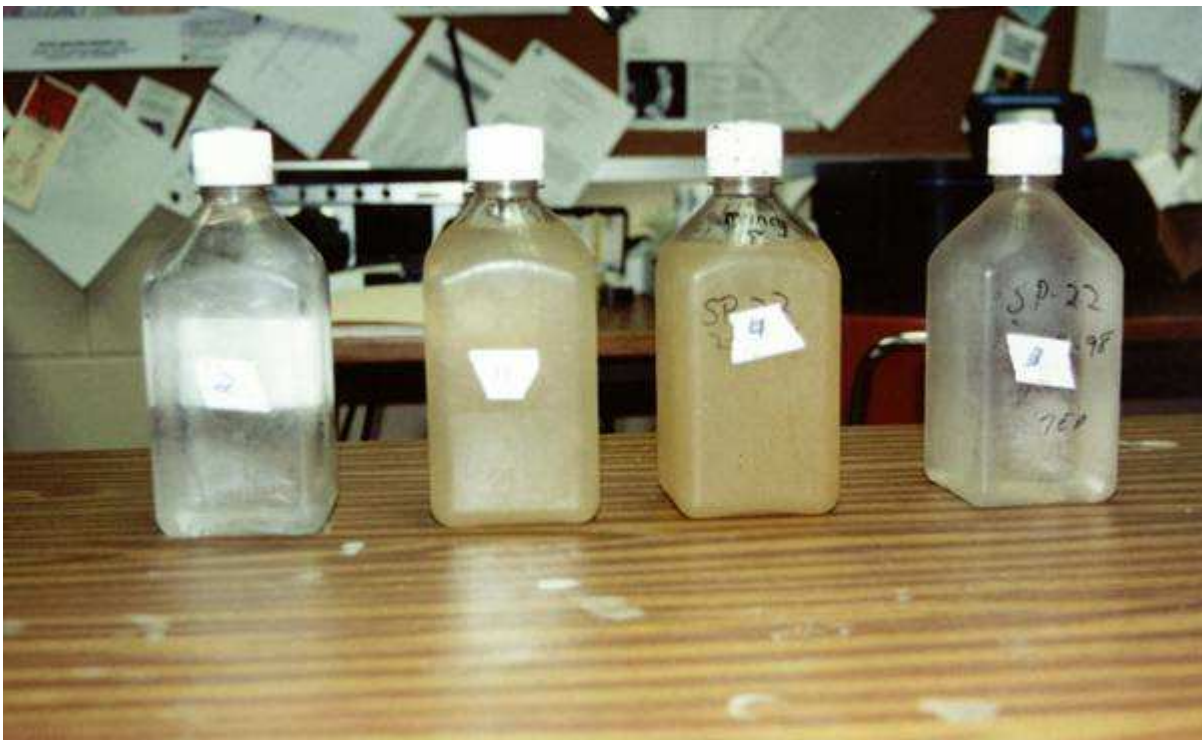
Sediment samples collected before, during, and after storm event