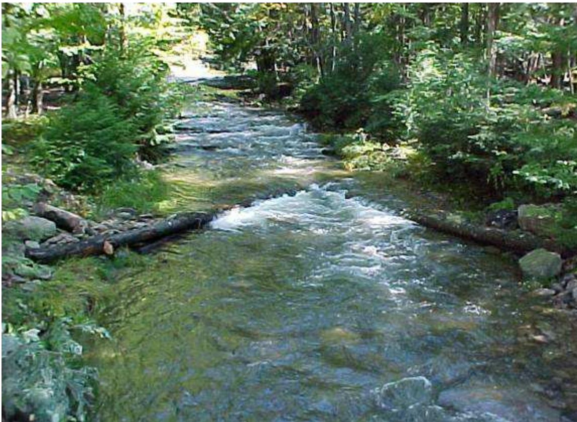
Test Run of log vein structure 1996