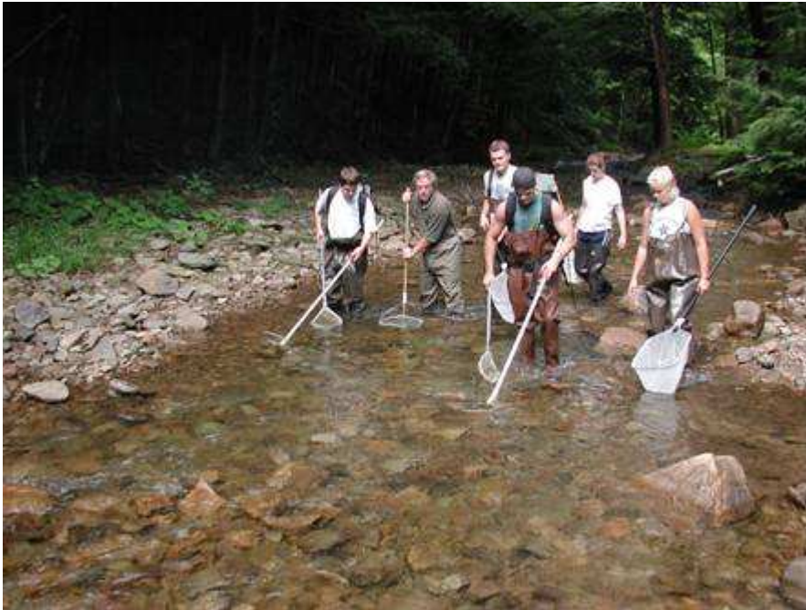
Electrofishing in Big Bear Creek