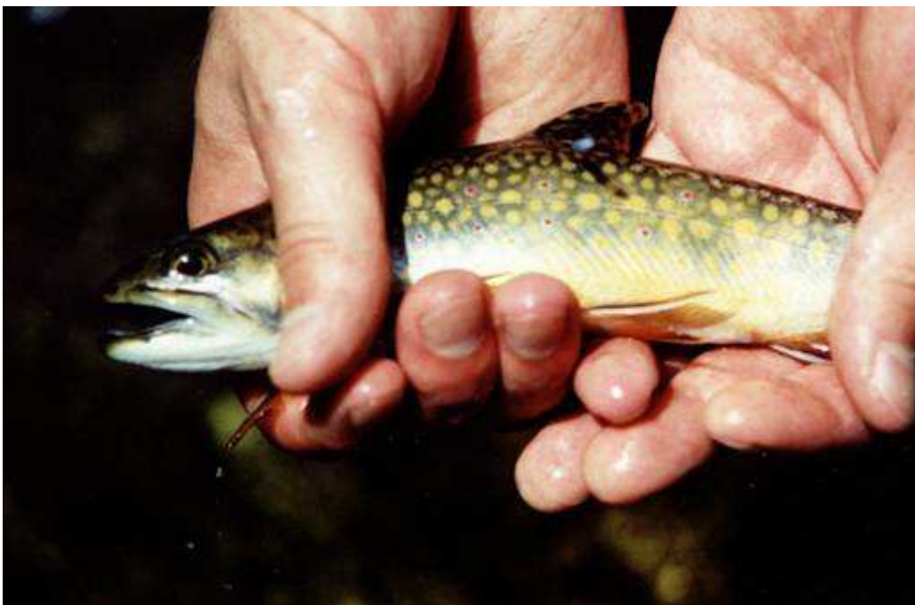
Tagged Brook Trout