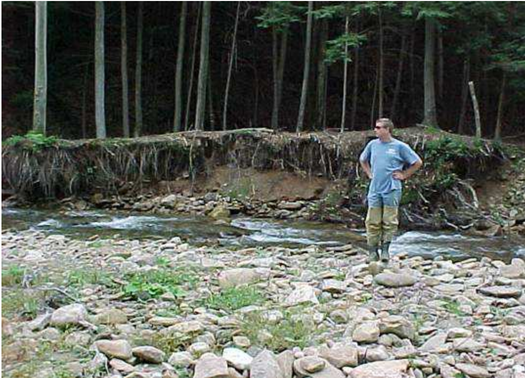
Severe Bank Erosion at Big Bear Creek prior to project