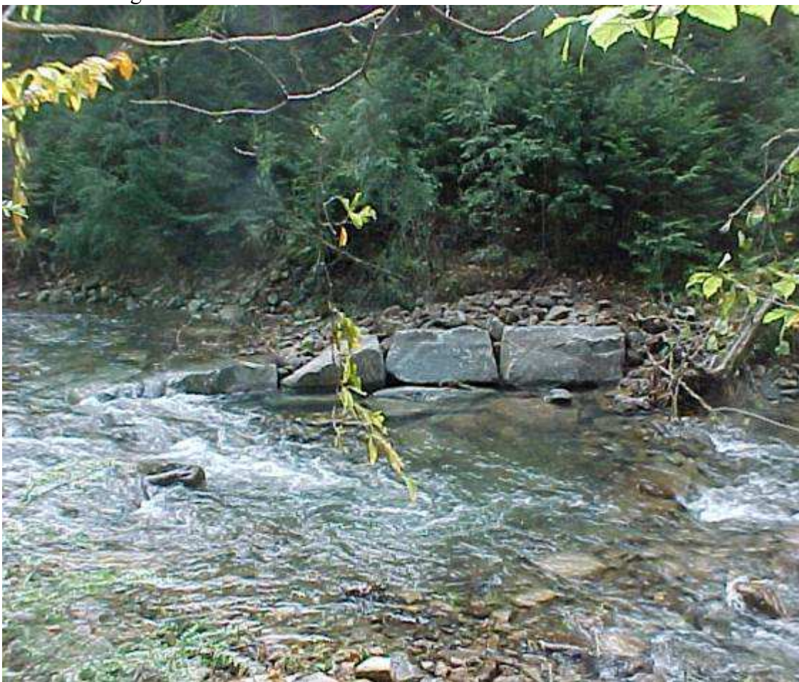
J- Hook Vein