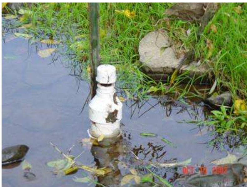
Event Sampler design (above) and in field operation (below). Collects water for sediment analysis.

These plans may be distributed widely just credit Grand Canyon Ecological Services