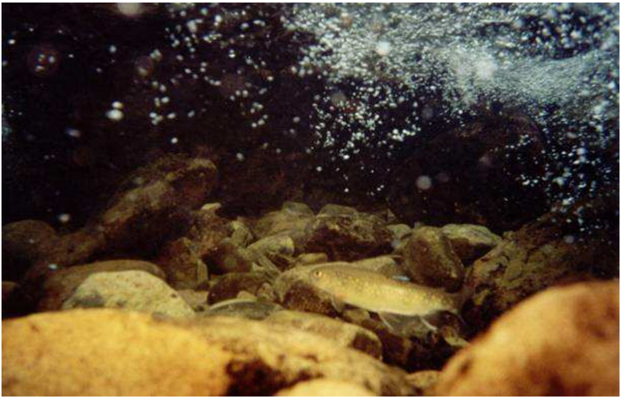
Tagged Trout observed during snorkeling