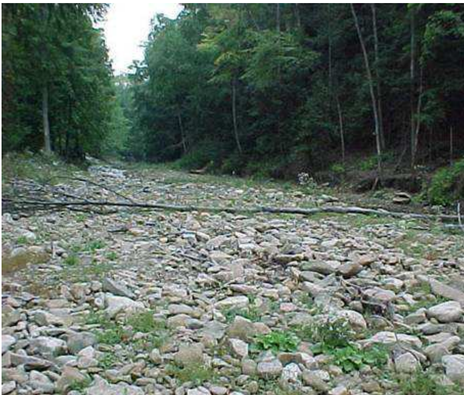
Over widened Channel with Subsurface Flow (this occurred in 6% of project area prior to restoration)