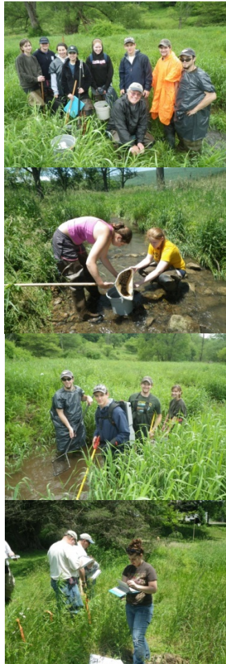
Wetland Training, Williamsport, PA