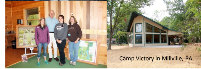
Camp Victory in Millville, PA