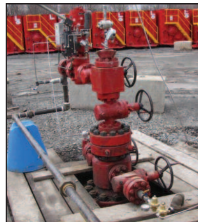
Once drilling is complete, a "Christmas tree" is placed at the surface

Due to the high demand for natural gas, drilling has increased. The third largest natural gas reserve in the world, some estimates show that the Marcellus shale formation could provide the United States with a 100-year supply of natural gas.