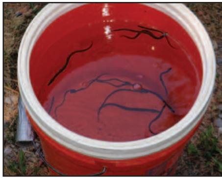
Eel release in Buffalo Creek