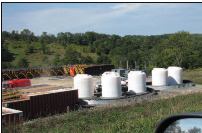
Completed well pad

The SRHCES's members have the experience and the technical knowledge to monitor and analyze flowback water, ground water, and surface water. Several of the SRHCES researchers have spent time studying and analyzing streams and other water systems. The group has members who have studied habitat changes and the impacts faced by animals from these changes. SRHCES is also building competency in understanding social-ecological system interactions and how these, in turn, influence long term community well-being throughout the Susquehanna River basin.