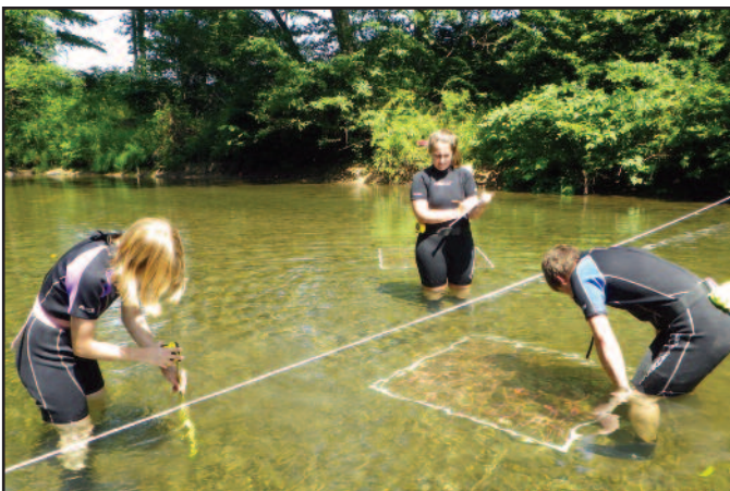
Lycoming College Students of Dr. Petokas monitoring stream for the Eastern Hellbender.

The two locations where the hellbender seems to be doing best are in the West Branch Susquehanna River sub-basin and in northern Georgia. Current results indicate that most existing West Branch populations are stable and self-sustaining, but at least one major population has declined precipitously in the past six years. Possible causes of the declines are diseases such as amphibian chytrid fungus, chemical pollution including endocrine disruptors, and invasive species such as the rusty crayfish. Habitat degradation has also limited where hellbenders can survive in Pennsylvania waterways.