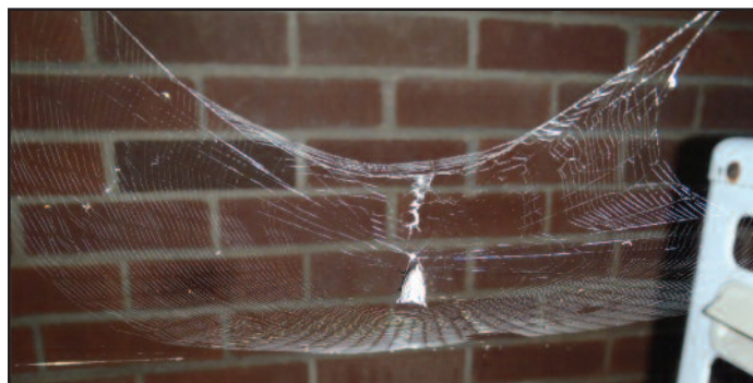
The web of a Spined Micrathena