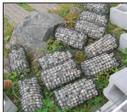
Rock baskets on bank of Susquehanna ready for submersion