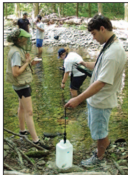
Bloomsburg students analyzing the West Branch of Fishing Creek