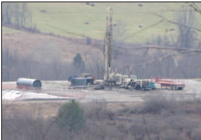
Well pad being constructed

Gas exploration and development companies from across the country are now working in Pennsylvania to drill into this formation and extract the natural gas, which is a relatively cleaner fossil fuel than coal. The drilling is having a profound effect throughout the Appalachian plateau of Pennsylvania. Development of the deep wells and the well sites — including construction of the entire supporting infrastructure: roads, compressor stations, pipelines, etc. — is just beginning to ramp up.